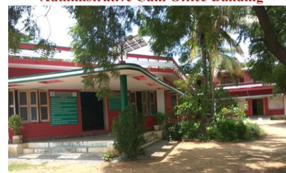
Administrative Cum Office Building