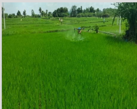
Drone mounted sprayer in Paddy field