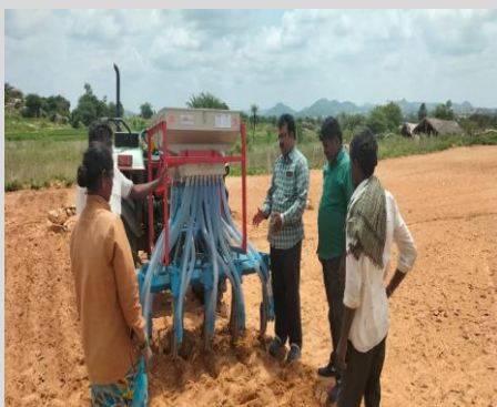
Demonstration of Seed drill in Groundnut