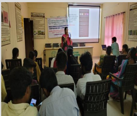
Training programme on Utilization of Digital solutions in Agriculture & Allied sector