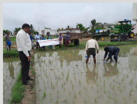
Demonstration of Alternate Wet and Dry (AWD) pipe technology in Rice