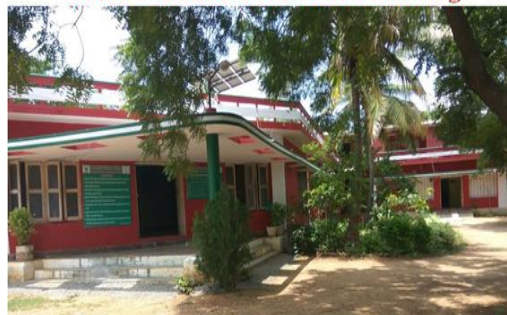
Administrative Cum Office Building