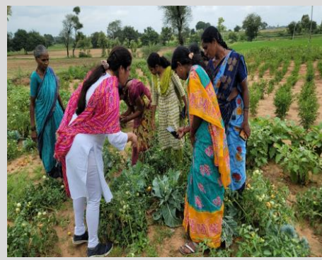
Demonstration of Plantix application in field level