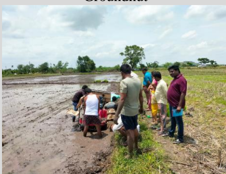
Demonstration on 4 row Rice transplanter