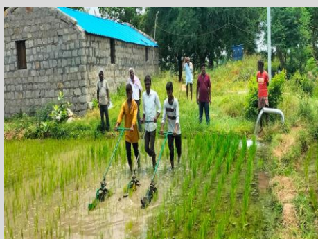
Demonstration of Cono weeder in rice fields