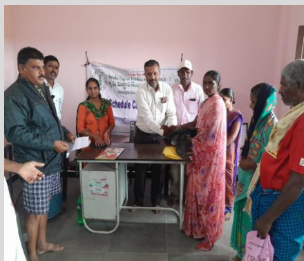
Training cum distribution of Backyard Poultry (Srinidhi)

SMS (Home Science) given a lecture on Nutritional and Health benefits of Oil seeds, Culinary preparations of value added products of Oil seeds and Different oil extraction techniques. Followed by Sr. Scientist and Head enlighten the Scope of Value-added products of Groundnut in Market in the Day-1. Later provided Hands on experience on extraction of groundnut and sesame oil. Day2: SMS (Agril.Extension) given a lecture on Marketing strategies and government support schemes for entrepreneurship development in oil seeds. Day3: Lecture on food safety & FSSAI regularities for oils & packaging technologies for value added products.