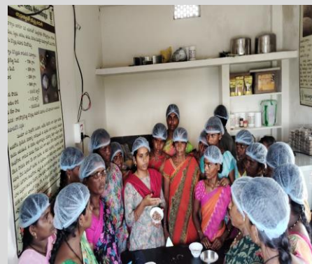
Skill training on value addition in oil seeds