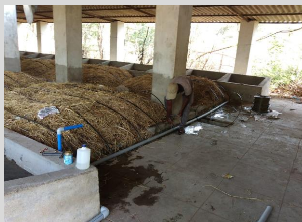
Initiated New vermicompost unit at KVK