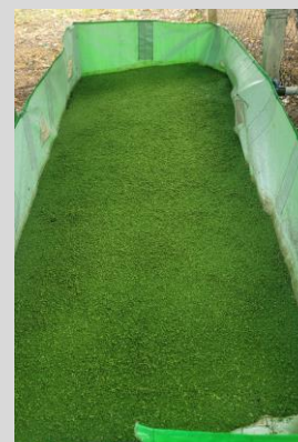
Initiated Azolla Unit