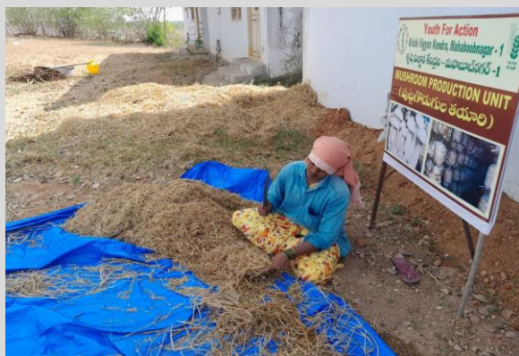
Initiated Mushroom unit at KVK