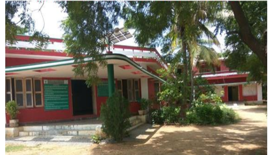
Administrative Cum Office Building