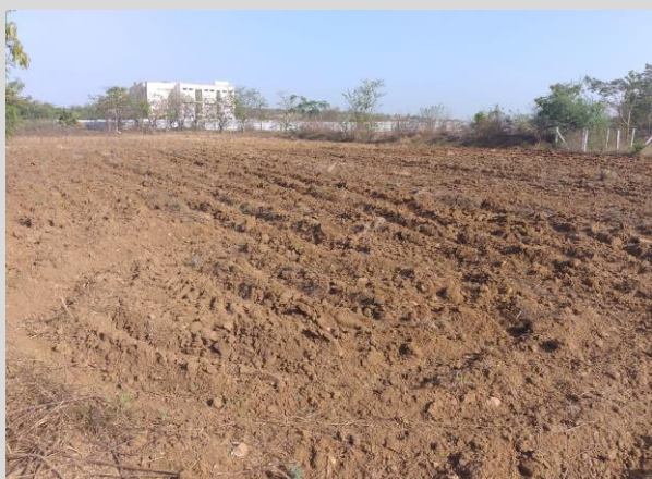
Land preparation for Millet production at KVK